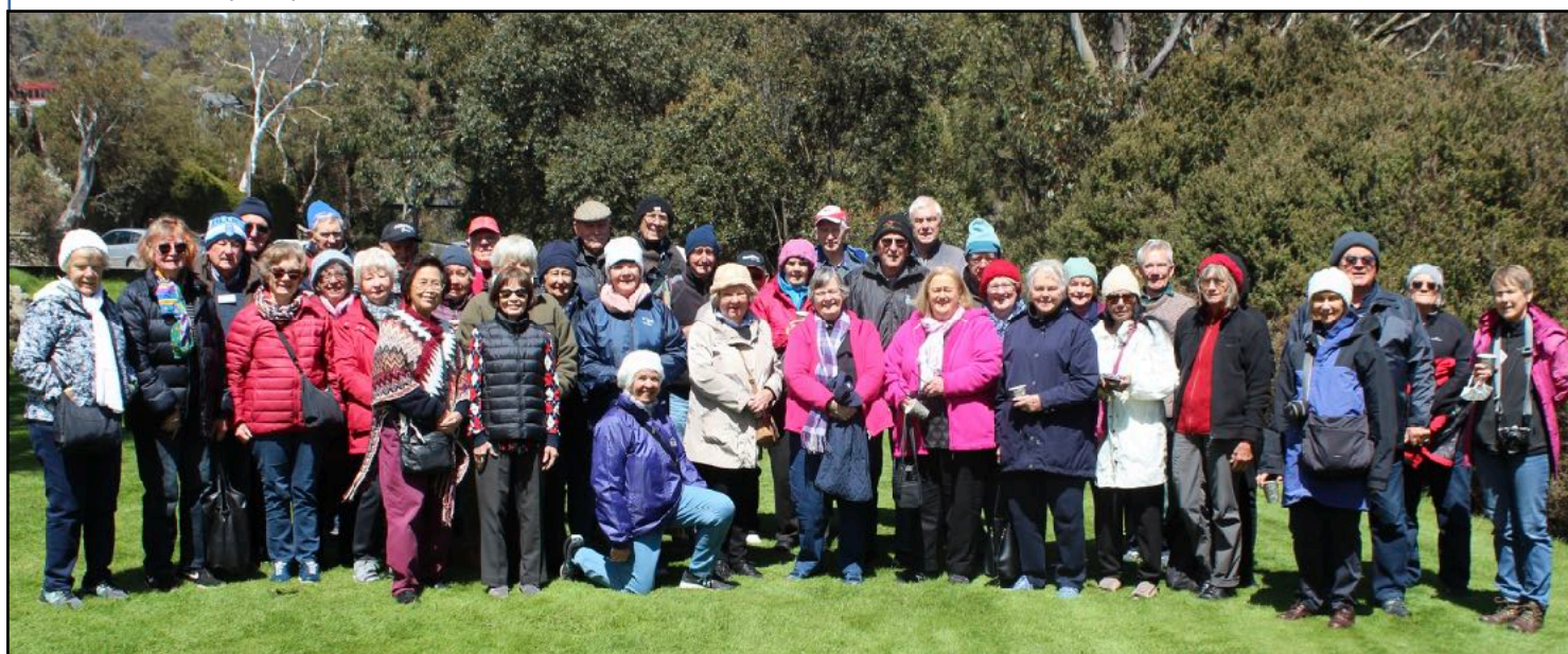
AMPC on the Jindabyne trip, at Thredbo, 15 November 2022