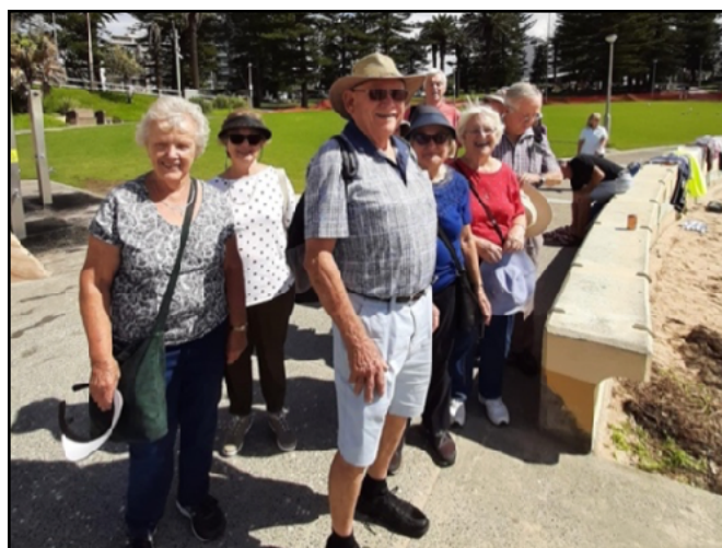
At Cronulla Beach in March