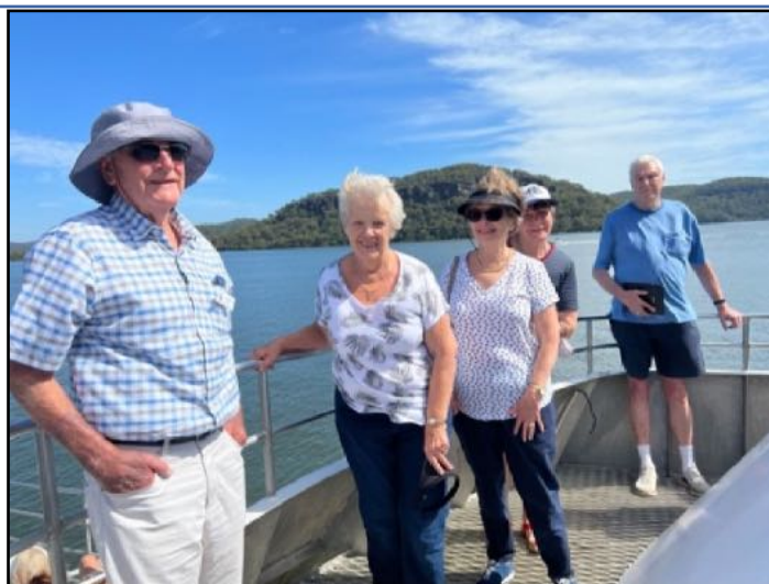
Summery conditions on the Riverboat Postman in February

during the month, on 30 September about 28 members enjoyed their three-hour Naval History cruise of Sydney Harbour. All marvelled at the tiny size of Cook's Endeavour, at the ingenuity of early boat builders, and at the dedication of decades of navy personnel