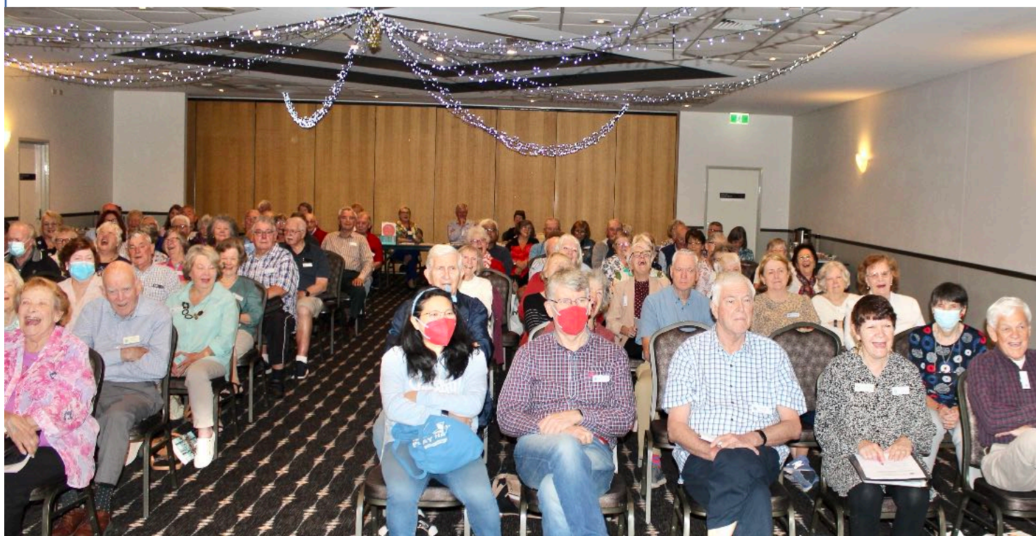
AMPC meeting at Magpies Waitara in January 2023