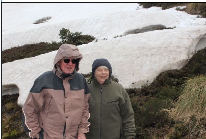
Chilly at the top of the chairlift in Thredbo, in November